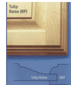
3. Tulip Raise