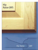
2. Hip Raise